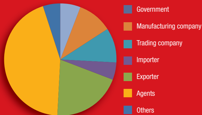
Top industry sectors